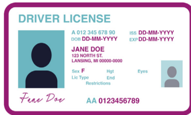
Valid Photo ID