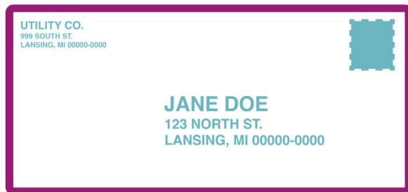
Recent bill/bank statement with address

Check voter ID requirements by state: vote.org/voter-id-laws/